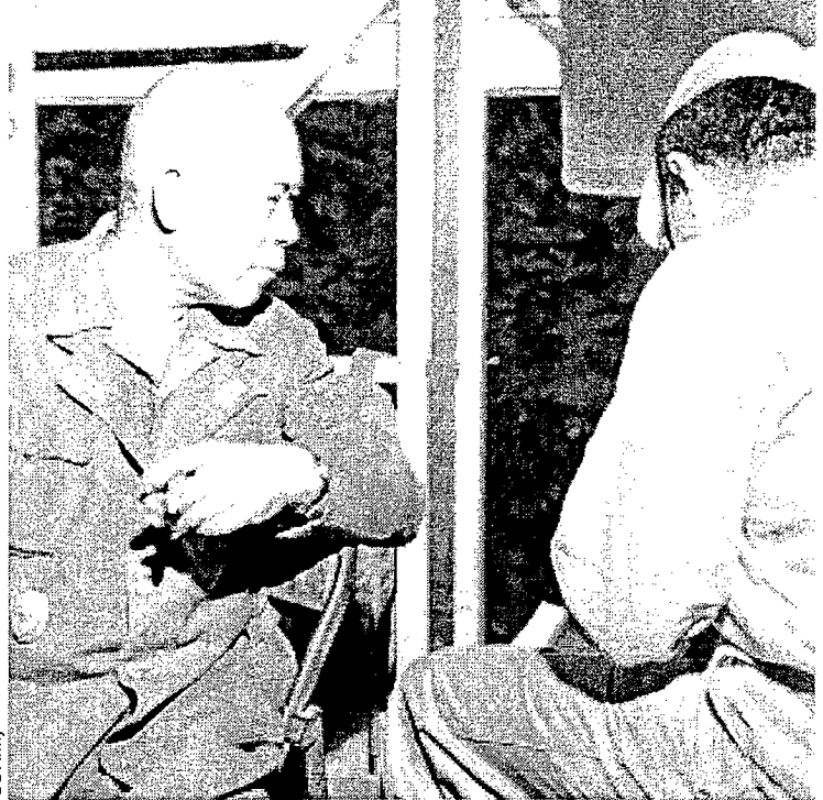
General Yamashita shortly after his 2 September 1945 surrender to U.S. forces in northern Luzon.

The adjudication of cases dealing with the jurisdiction of a military commission actually began during the Civil War. As an alleged Lincoln Assassination conspirator, Dr. Samuel Mudd was tried in Washington, D.C., by a military commission. Mudd was a citizen of Maryland, a border state, and had not been in the military. At the time of his trial, the civil courts in Washington and Maryland were open. 73 Mudd was convicted and sentenced to a term of imprisonment. In 1866, after the Milligan