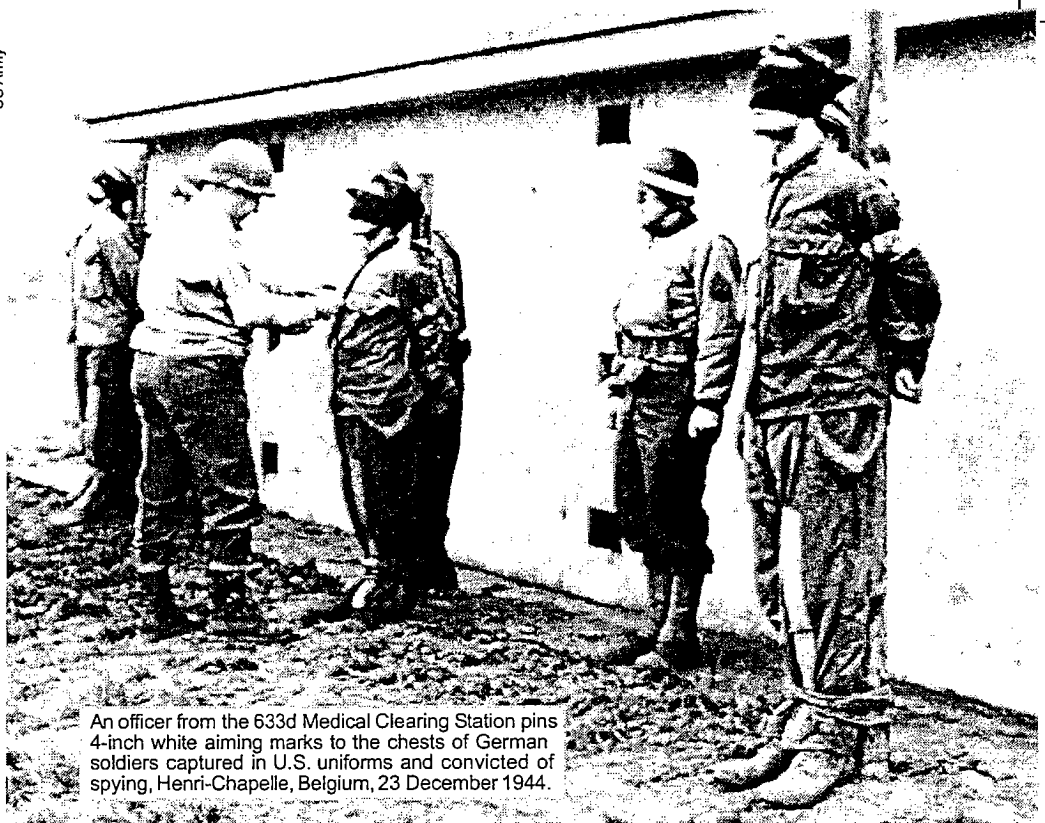
An officer from the 633d Medical Clearing Station pins 4-inch white aiming marks to the chests of German soldiers captured in U.S. uniforms and convicted of spying, Henri-Chapelle, Belgium, 23 December 1944.

During the labor strife and civilian unrest in the United States in the early 1900s, some governors instituted martial laws, and several states used military commissions to try civilians charged with violations of martial law. In 1912 and 1913, state military commissions in West Virginia tried at least seven individuals for violations of martial law imposed by the state governor. 49 In Nebraska in 1922, several defendants were tried before a state military commission during a period of martial law. They were convicted and sentenced to prison terms. The U.S.