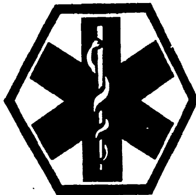
Figure 14-1. DA Label 162 (Emergency Medical Identification Symbol), shown actual size

b. DA Label 162 is a self-adhesive label depicting the "Star of Life" (fig 14-1). It consists of a white serpent on a white staff superimposed on a red star with a white background. DA Label 162 is affixed to the HREC, OTR, CEMR, and DD Form 2766 (folder construction only) to assist in the recognition of selected health problems documented within these records. It will be affixed to these records in conjunction with issuance of the Medical Warning Tag.